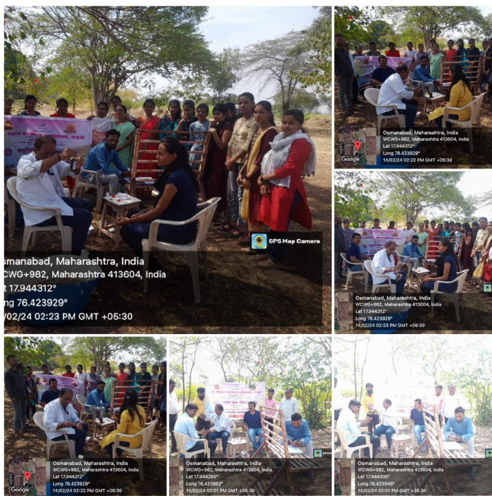
Health check-up camps for women and girls

Women entrepreneurship development programme: The College has organized 30 days Fashion Designing Certificate Course for Women entrepreneurship development with collaboration with Government Girls Polytechnic College.